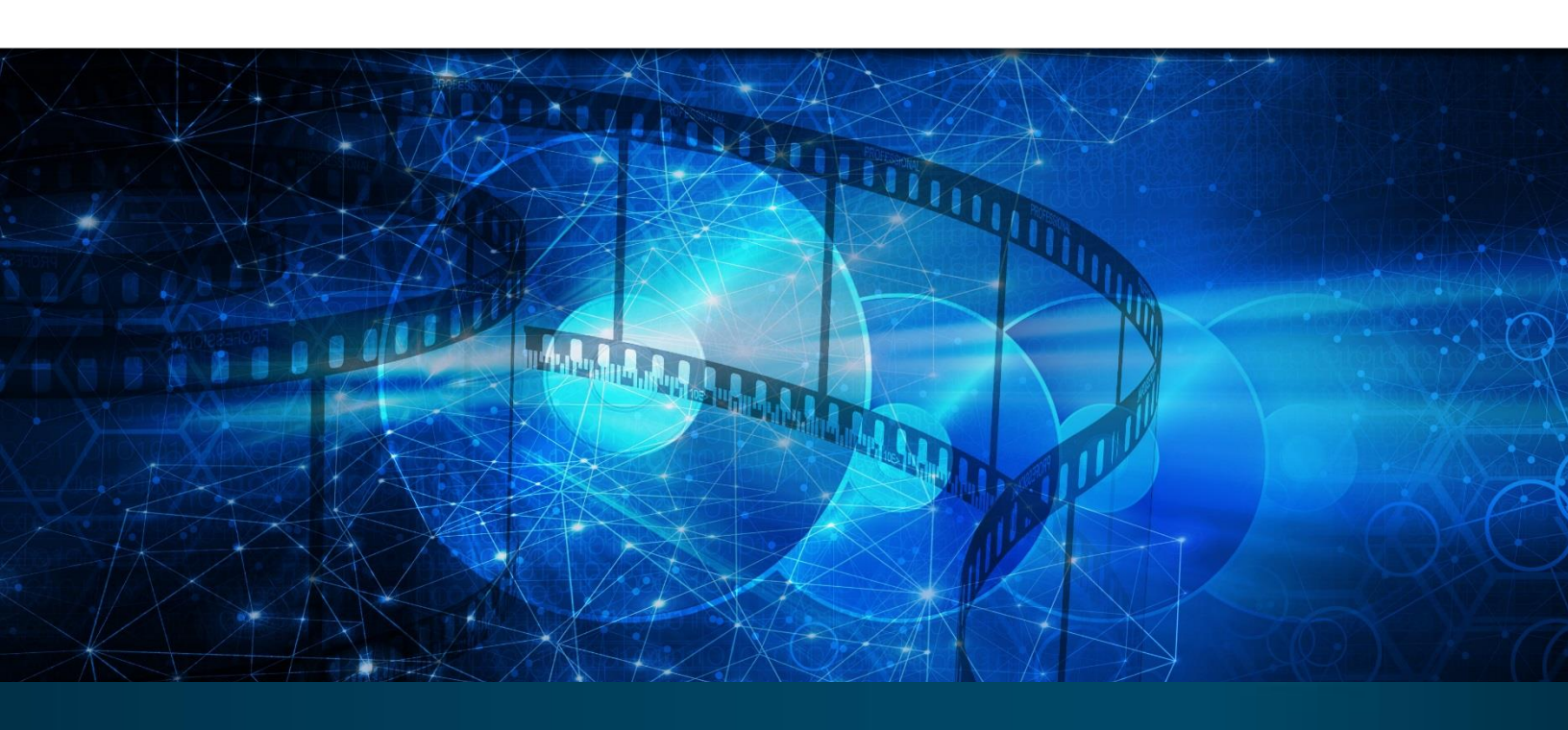
Table of Contents 2017

Digital Natives: Video Strategies for Millennials and Gen Z